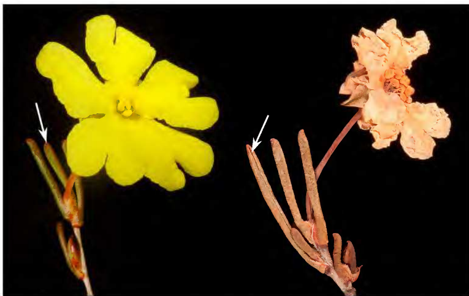
Figure 2. Hibbertia leptopus . Left – fresh flower (PERTH8339562); right – flowering shoot from dried specimen (PERTH6639429). Arrows highlight the grooved (folded) adaxial leaf surface.

Both species have (9–)11(–15) stamens around the three glabrous carpels, with usually three grouped (but free) stamens each alternating with two single stamens (i.e. a pattern of 3-1-3-1-3 stamens around the carpels), and short, almost globular anthers. They appear to be closely related.